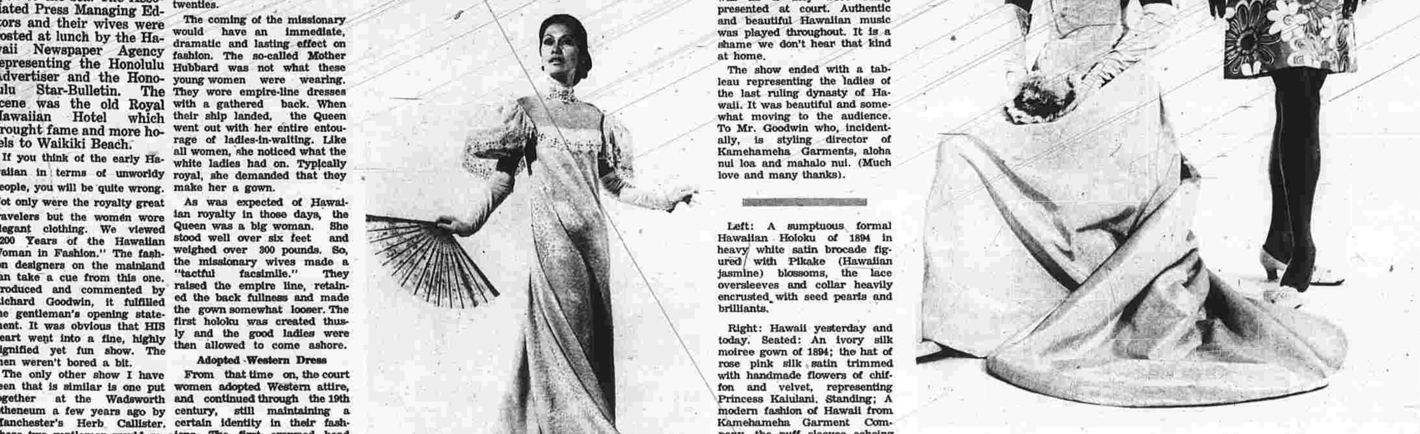
Left: A pompous formal Hawaiian hula of 1894 in heavy white satin brocade figured with hibiscus (Hawaiian jessamine) blossoms, the lace overleaves and collar heavily encrusted with seed pearls and brilliants.