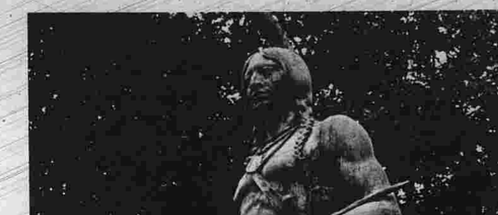
MASSAHOIT, FRIEND TO THE PILGRIMS

And just as, after the campaign, the suggestion was that the sooner Mr. Nixon got back to being President, the better, so it might be added, now that the kind of President he should get back to being is that kind of President who presented, at least, to have abandoned the idea he could best North Vietnam into submission at the conference table.