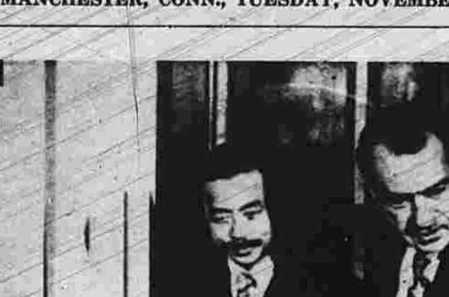
President Nixon walks with South Vietnamese Vice President Nguyen Cao Ky after their breakfast meeting this morning at the White House.

Washington (AP) — Sen. George D. Aiken, R-Vt., said today the nation faces disaster unless President Nixon puts a bipartisan foreign policy ahead of partisan domestic political considerations.